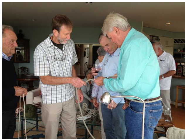
Fun and fellowship over a knot or two