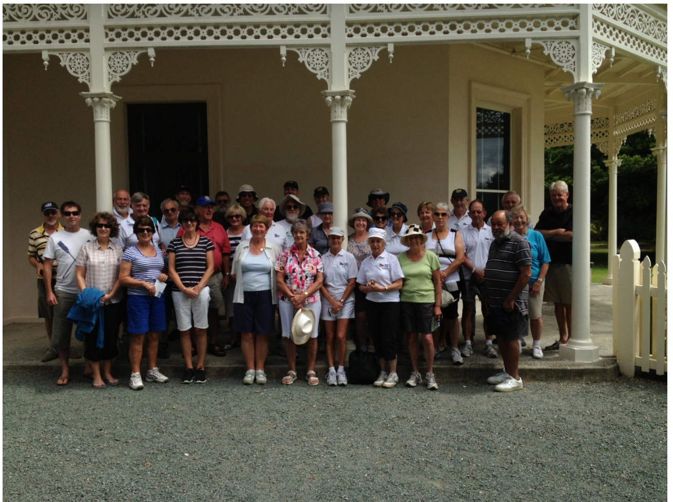
Outside Mansion House

What a wonderful weekend this was. Over 40 members and friends enjoyed sailing, boating, walking, eating and drinking – all the things IYFR is about. The weather was great and the fellowship was amazing. It was an international gathering with IYFR members from Sweden, England plus friends from Canada and America as well as members from the Bay of Islands Fleet.