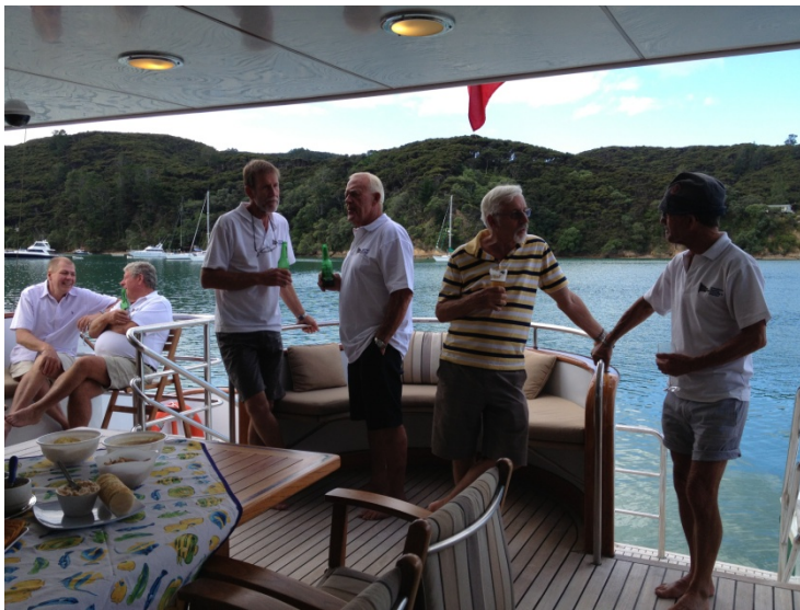
Drinks aboard Pacific Mermaid